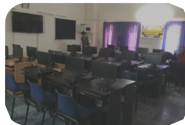
We helped fund this computer lab for a school in India

The founder’s grandchildren are prepared to carry on the charity’s work in the future.